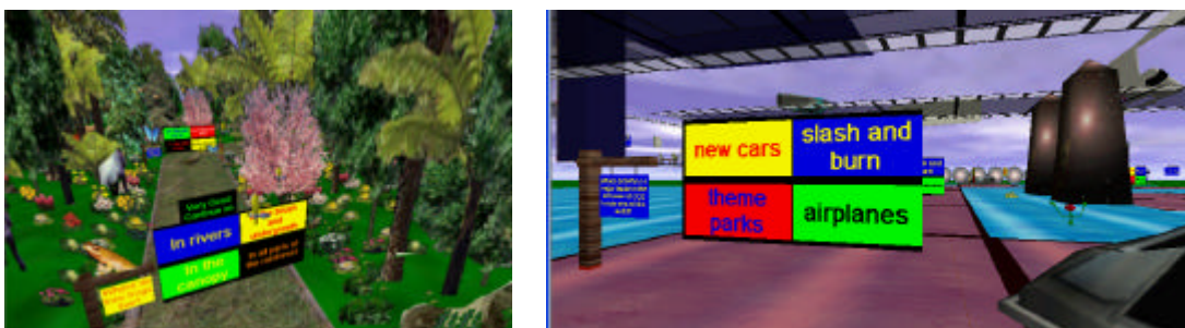
Figure 2. Quiz mazes featuring student visions of rainforests past and present. Student researched questions and answers for the game. In a Showcase, they coached new players through the game. For help in answering the question, a player clicks on the creature perched above the question sign, which activates a Web link and opens a reference resource in the Web window of the browser. (This leverages a standard feature in the software.) A mouse click on the correct answer teleports the player forward in the maze. The choice of an incorrect answers results in the players' return to the beginning of the maze.

Five sites completed successful year-long SciFair programs in 2003/4. Two additional sites conducted modest trials. More than 70 students participated in school-based SciFair programs at the five primary sites in 2003/4. Approximately 25 more teens participated in short term projects and internships. The outcomes of SciFair projects are graphically demonstrated in the spaces themselves, which range from an expansive set of mazes filled with quizzes and surprising facts about the tropical rainforest, to an elegant world created by coastal American Indians that includes slide shows about tsunamis and a multimedia gallery used by Cornell undergraduate researchers to present the results of their experience learning to create tsunami waves in a tank.